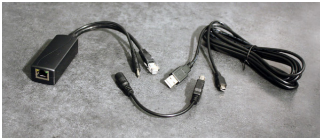
F200 PoE Kit Components