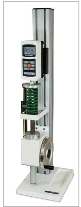
Shown with a TSF test stand in a spring testing application

The gauge include MESUR™ Lite data acquisition software. MESUR™ Lite tabulates continuous or single point data. Data saved in the gauge's memory can also be downloaded in bulk. One-click export to Excel easily allows for further data manipulation.