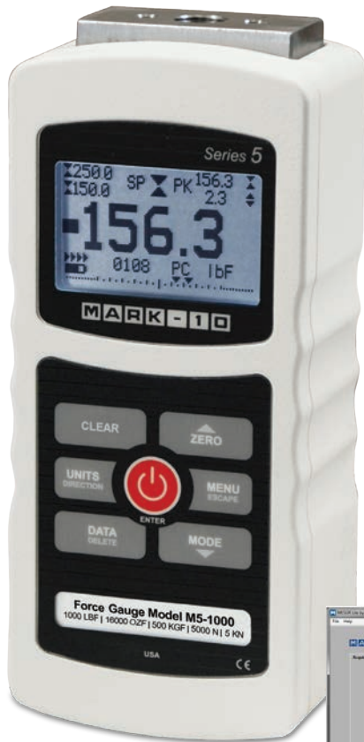
MESUR™ Lite data acquisition software is included with the gauges