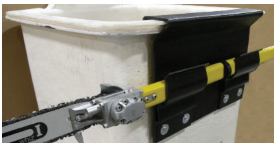
24-23 Long Reach Chainsaw Holder For Telescoping Boom Trucks or Spider Lifts.

Holds round- and oval-handled long reach hydraulic chainsaws and gas powered pole pruners (standard and telescoping). 14"H x 18"W x 4"D