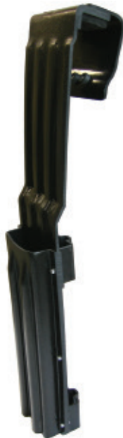
24-14A Chainsaw Scabbard Fits standard and hydraulic pistol grip chainsaws. Adjustable clamp bracket.