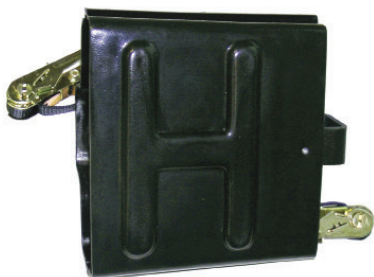
24-02 Circular Saw Holder Includes Handle Holder Unit 11.5" H x 11.75"W x 6.5"D

Offering out-of-bucket storage for tools, these heavy duty tool holders mount on the boom. Water repellent and UV resistant, they are designed to withstand extreme weather conditions.