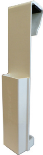
24-18L Fiberglass Chainsaw Scabbard with Removable Liner Fits standard and hydraulic pistol grip chainsaws. Adjustable clamp bracket. 32.5"H x 7.5"W x 7"D

Jameson's heavy duty bucket and boom mount tool holders are water repellent and UV resistant to withstand extreme weather conditions.