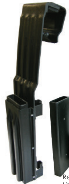
24-14L Chainsaw Scabbard with Removable Liner Fits standard and hydraulic pistol grip chainsaws. Replaceable liner protects scabbard from chainsaw heat and blade. Adjustable clamp bracket.