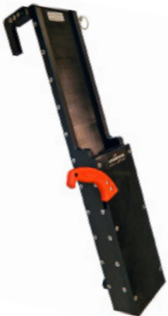
24-19 Chainsaw Scabbard with Handsaw Holder Jameson's latest chainsaw scabbard includes a handsaw holder for easy access during line clearance work. To prevent blade wear and protect against extreme weather conditions, the scabbard is constructed with durable HDPE.