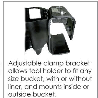
Adjustable clamp bracket allows tool holder to fit any size bucket, with or without liner, and mounts inside or outside bucket.