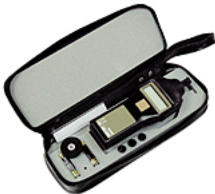
◀ TM-5000K/TM5000EK TM-5000 Kit models TM-5010K/TM-5010EK TM-5010 Kit models TM-5010E Kit models

All kit models includes the main unit, reflective tape, contact adapter, rubber tip, surface speed wheel, AAA batteries and carrying case.