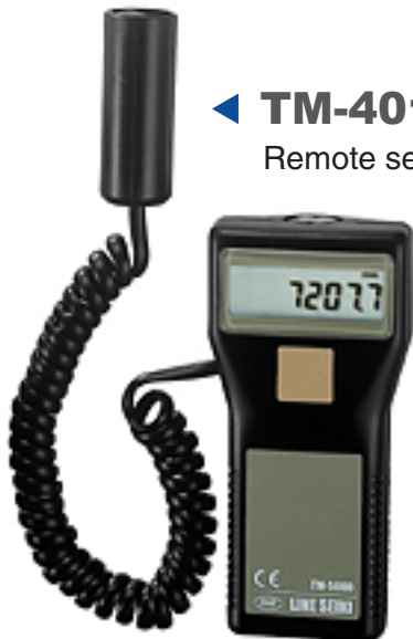
◀ TM-4015 Remote sensor