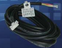
Power supply, signal cable (included)

Low-flow ionizer for gentle, efficient delivery of ionization