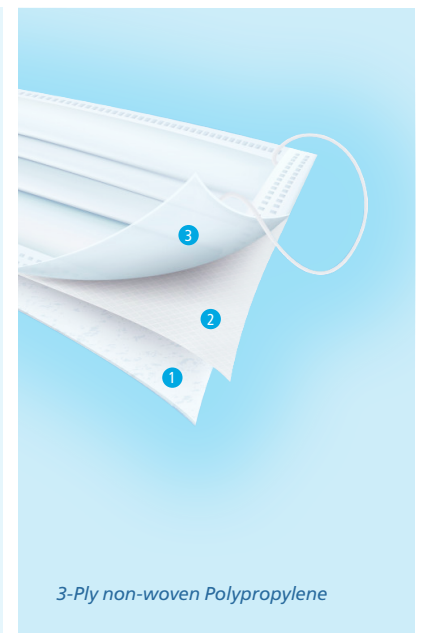
3-Ply non-woven Polypropylene