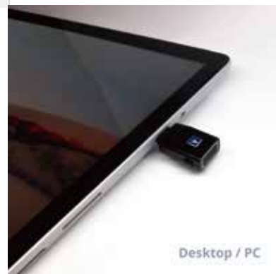
Desktop / PC