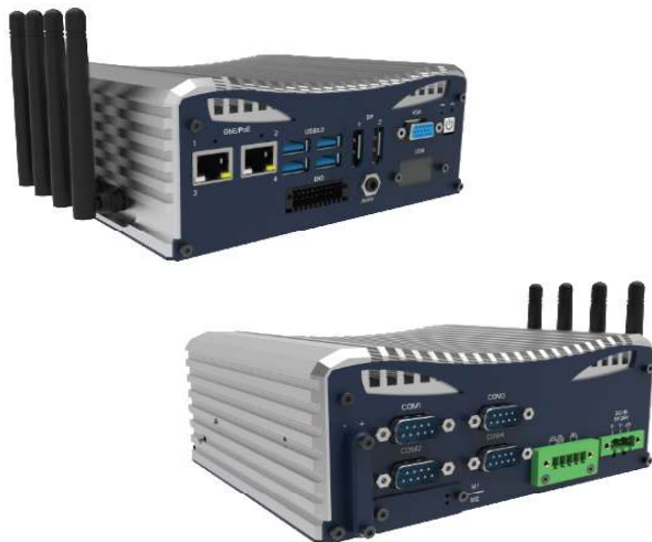
Models shown with Optional Antennas Kit

6th Generation Intel® Core™ U Series Processor Fanless Box Computer, 2x RJ45 GbE