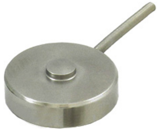
Compression force transducer, model F1226